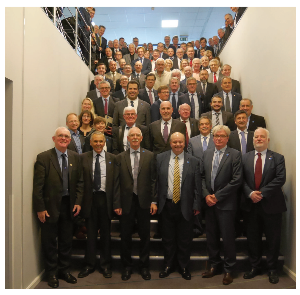
UEMS Group photo - Brussels, October 2018