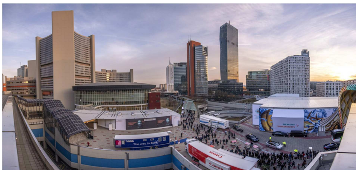
A glimpse of ECR city - Austria Center, Vienna

On behalf of the Bureau of the Section, please find your copy of the periodical Newsletter. This second issue of 2019 has been almost entirely dedicated to the European Congress of Radiology, the event annually organised by the ESR-European Society of Radiology, which has hosted the Spring meeting of the Section and the meeting of the Division of Neuroradiology. A summary of both meetings is available in the next pages, together with a review of the most significant moments of collaboration between the UEMS and the ESR.