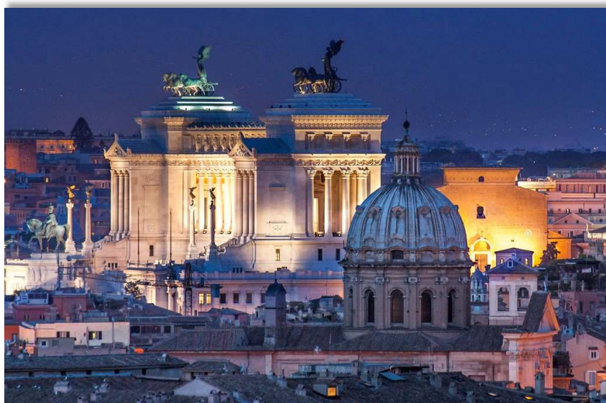
A night view of Rome - venue of the last meeting of the Section